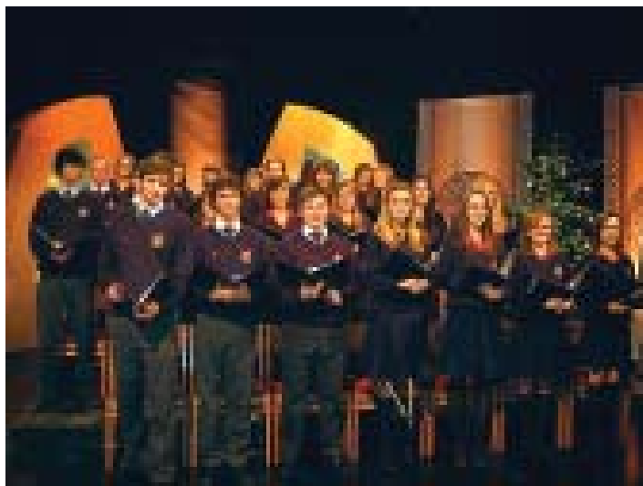
The Senior Choir performing in the RTÉ Christmas Service.