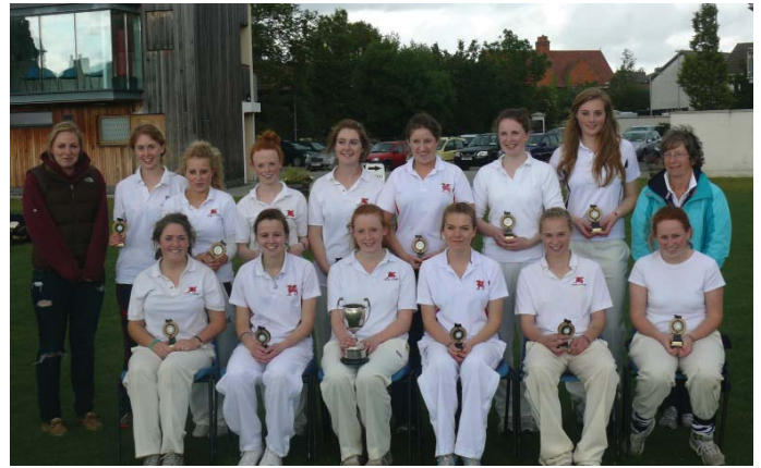
Senior Girls Cricket squad

Congratulations to the Senior Girls who won their final against Mount Anville by ten wickets. The last time it was won by Wesley was in 2008. The Senior 2 Girls also reached their final but lost to Alexandra 1 team in a very competitive match. Nonetheless, it was great all round effort by the girls.