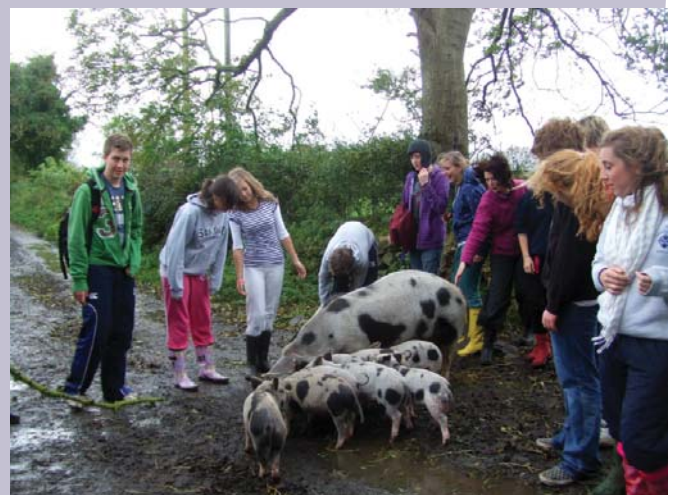
Transition Years getting a taste of the rural life on the Causey Farm

In September, the Transition Years took off in auspicious weather to Three Rock for their bonding day. The climb was interspersed with a variety of team building games which provided an opportunity to get to know new classmates. There were some interesting tasks on the trek up which encouraged group work and culminated in the hokey-pokey. Unfortunately, the weather took a turn for the worst and only two brave teams made it to the summit. On return they were greeted with their long-awaited Junior Certificate results and many triumphant scenes ensued. Thanks to the teachers who accompanied them and of course congratulations on such great results.