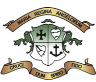
Loreto College Foxrock