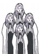
Firhouse Community College